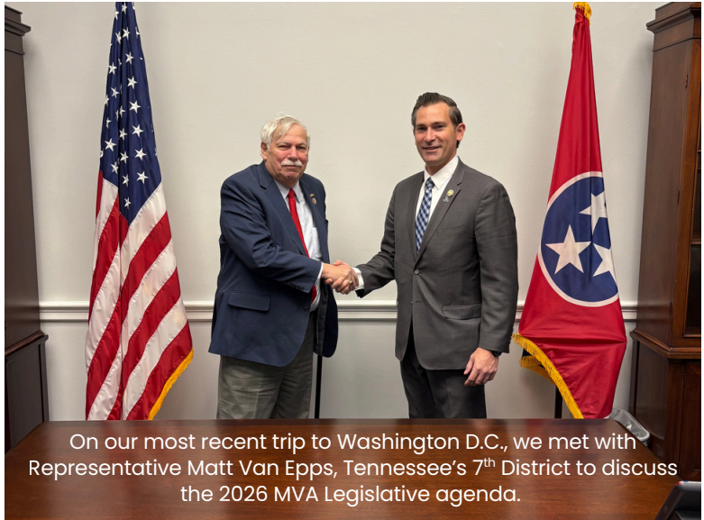
On our most recent trip to Washington D.C., we met with Representative Matt Van Epps, Tennessee's 7 th District to discuss the 2026 MVA Legislative agenda.