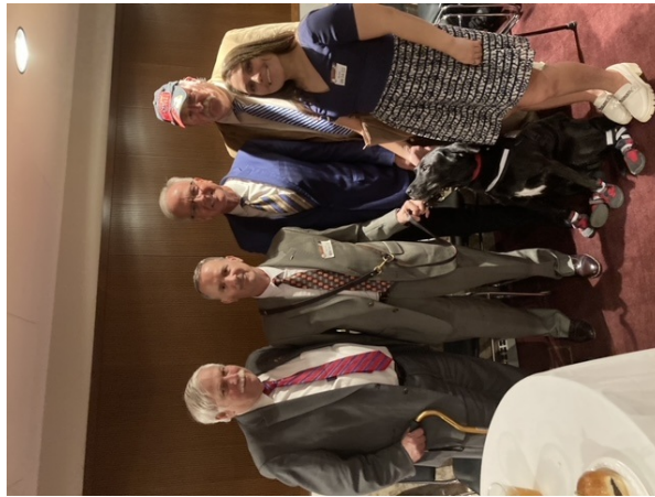
MVA™ with Senate Committee on Veterans Affairs Ranking Member, Senator Jerry Moran - KS