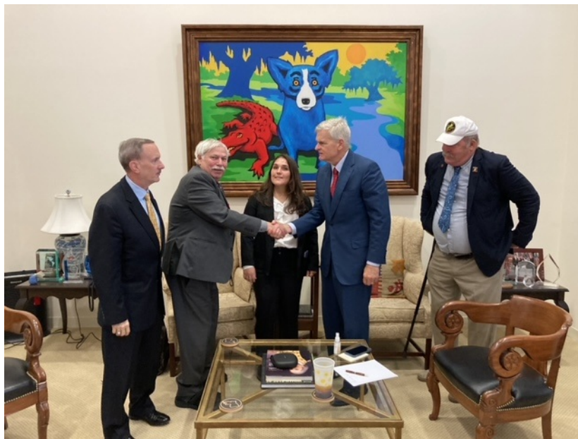
Representatives of MVA™ with Senator Bill Cassidy, LA

Your MVA Board has put in over 7000 hours so far in 2022